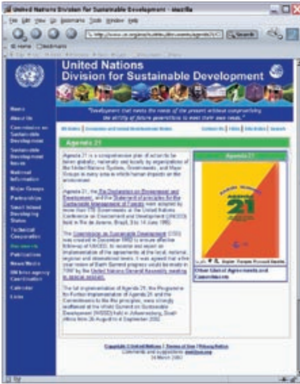
Image 1: The United Nations website clearly displays Agenda 21 documents

known as the Rio Earth Summit, where more than 178 nations adopted Agenda 21, and pledged to evaluate progress made in implementing the plan every five years thereafter. President George H. W. Bush was the signatory for the United States.